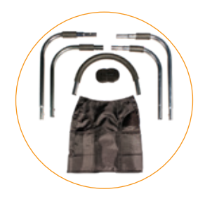
SNAP TOGETHER ASSEMBLY