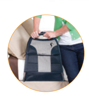
WEIGHS LESS THAN 2 LBS, SUPPORTS UP TO 300 LBS