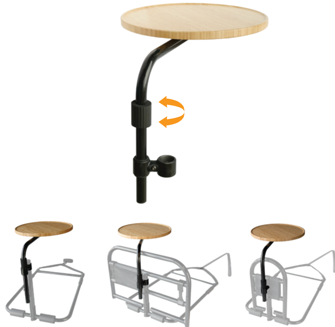
Shown with the #8940 - Prime Safety Bed Rail™ and #8930 - Prime Bed Handle™