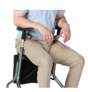
SUPPORTS UP TO 350 LBS