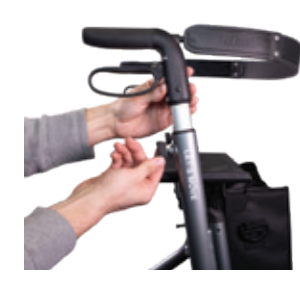
HANDLE HEIGHT ADJUSTS 30.5" – 36.5"