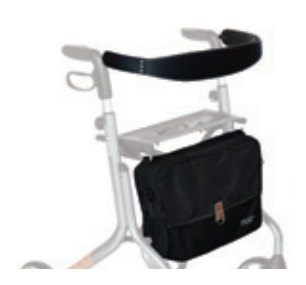
INCLUDES A BACKSTRAP AND BAG