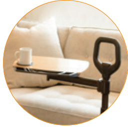
INCLUDES CUP HOLDER AND UTENSIL COMPARTMENT