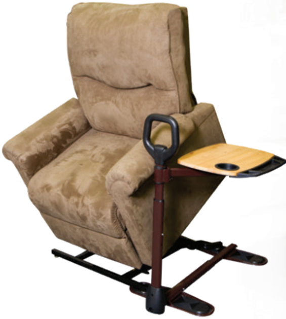
FITS MOST ANY COUCH, CHAIR, OR LIFT CHAIR