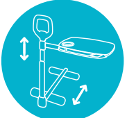
ADJUSTABLE IN HEIGHT AND DEPTH