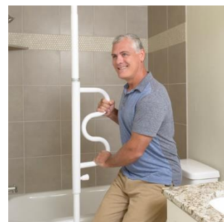
Security Pole & Curve Grab Bar