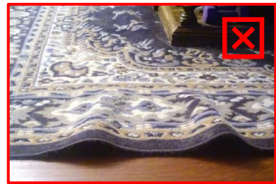
Rug with curled edges