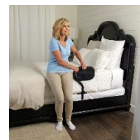
Stander Bed Handles