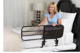
Stander Bed Rails

Contingency plan to prevent nighttime falls: